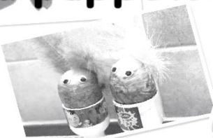
Decorated boiled egg