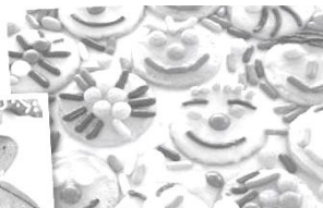
Decorated Marie biscuits